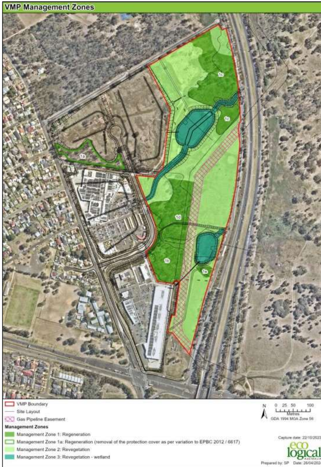
Appendix A. VMP Survey Area and Management Zones (ELA 2024).