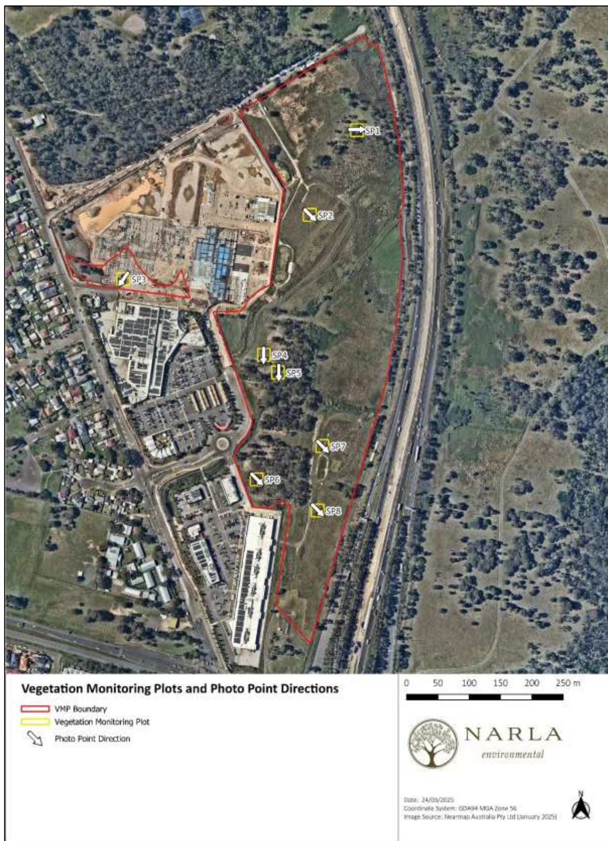
Figure 1. Vegetation Monitoring Plots and Photo Point Directions